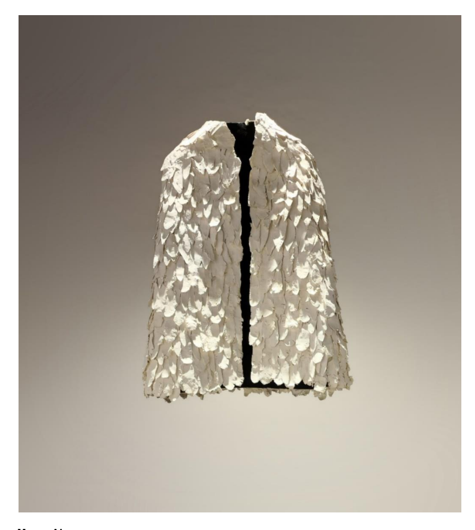
Marco Alom Diosa (2022) Embossing paper and paint, 85 x 70 x 37 cm. / 33,5 x 27,5 x 15,5 in. 7,500 usd