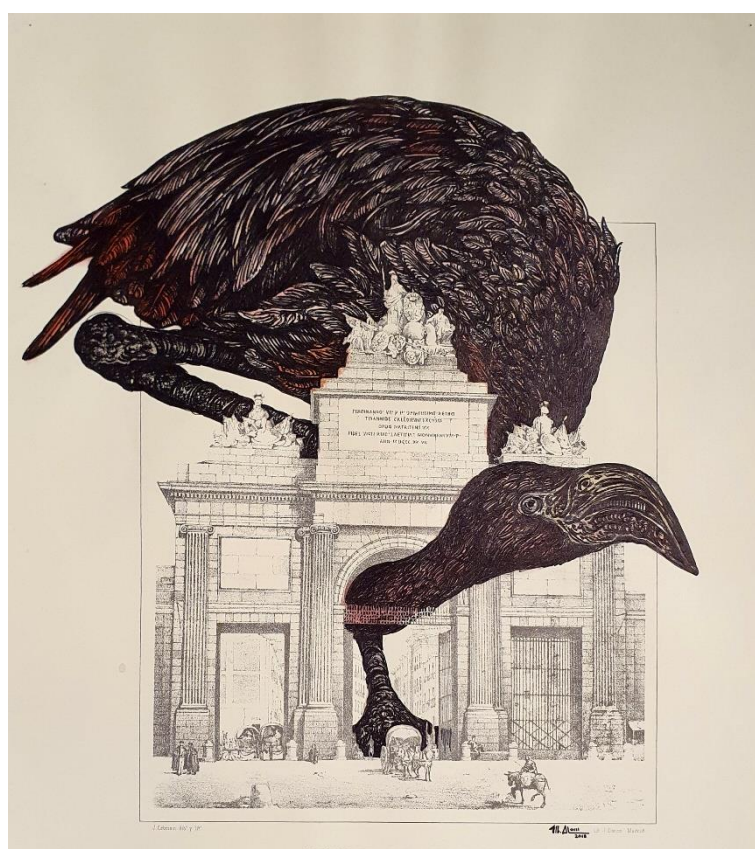
PUERTA DE TOLEDO.

Marco Alom Untitled (2018) Ink on engraving, 50 x 35 cm. / 19 x 14,5 in. 900 usd